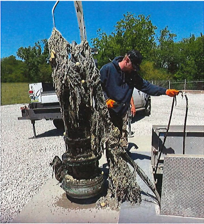
Removed on 5/21/25 for PM